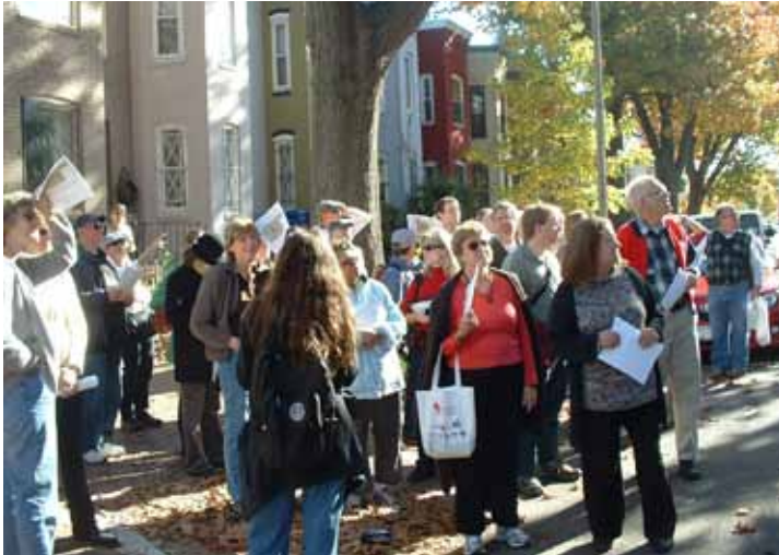
Walking tour looks at alley details; alley water pump in DC, circa 1935.