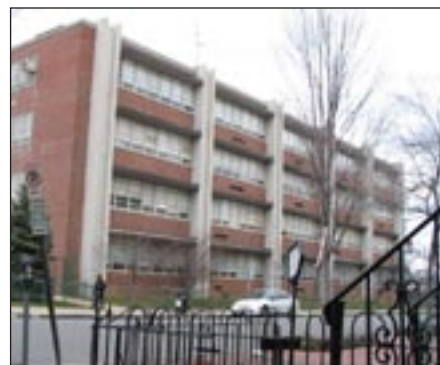
Hine Junior High from Eighth Street, SE.